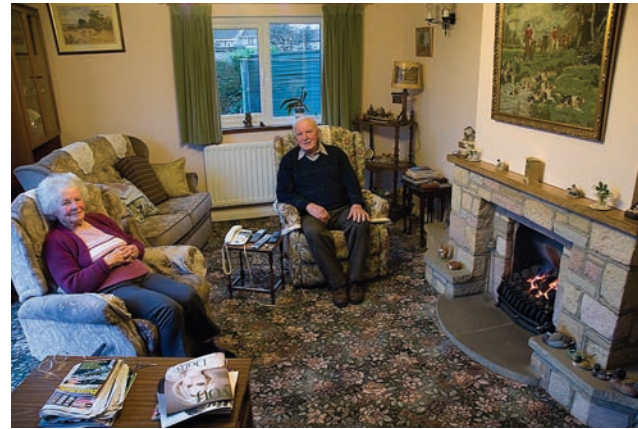
FIGURE 18.1 An older couple at home in their living room in northern England. One’s home is not only a physical environment, but also a place of activities, an anchor of identity, a repository of memories, and a center of stability and continuity. A major task for the occupational therapist is helping clients to recover as much as possible their sense of home and at-homeness.

Another important aspect of the lifeworld is home and at-homeness (Blunt & Dowling, 2005; Gitlin, 2003; Mallett, 2004; Manzo, 2003; Moore, 2007; Rioux & Werner, 2011; Seamon, 2010). These studies indicate that home has specific physical, personal, social, cultural, and political dimensions but, experientially, is lived as a human and